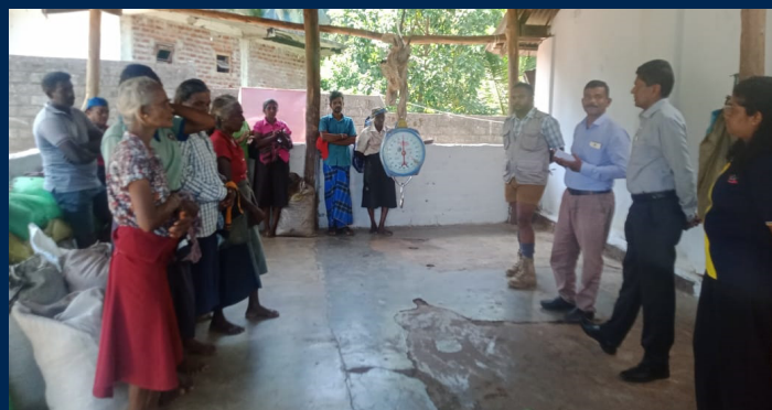
Ratwatte Estate (EPL) at 30 th July 2025

As part of the Clean Sri Lanka Project – 2025, an awareness programme was conducted at Ratwatta Estate and Pitakanda Estate to discuss the re-roofing and minor repair work planned for selected line rooms. The sessions highlighted the importance of active beneficiary participation to ensure the project's success. Estate Managers and Project Coordinators were assigned to arrange labour and carry out the work, while PHDT is responsible for coordinating all stakeholders, supplying materials, ensuring quality and proper usage, and overseeing timely completion.