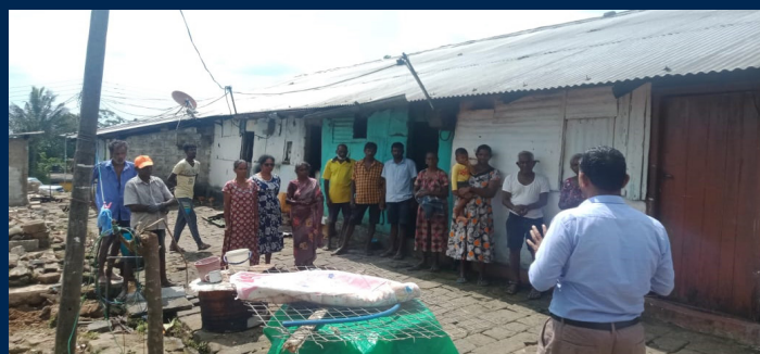
Pitakanda Estate (EPL) at 30 th July 2025