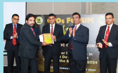
Parambe Estate Kegalle Region