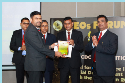
RYE / Wikiliya Estate Rathnapura Region