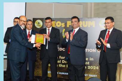
New Peacock Estate Nuwara Eliya Region