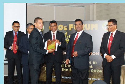
Kenilworth Estate Hatton Region