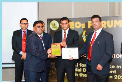
Hulandawa Estate Galle Region

Memory of the last CEOs' Forum, CDC AWARD CEREMONY.