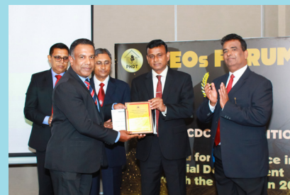
Kahagalla Estate Badulla Region