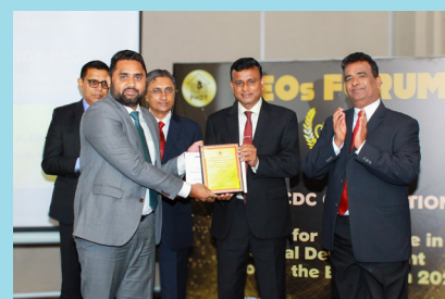
Hellebodde Estate Kandy Region