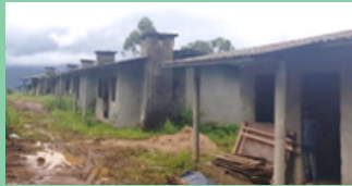
Kandal Oya Estate